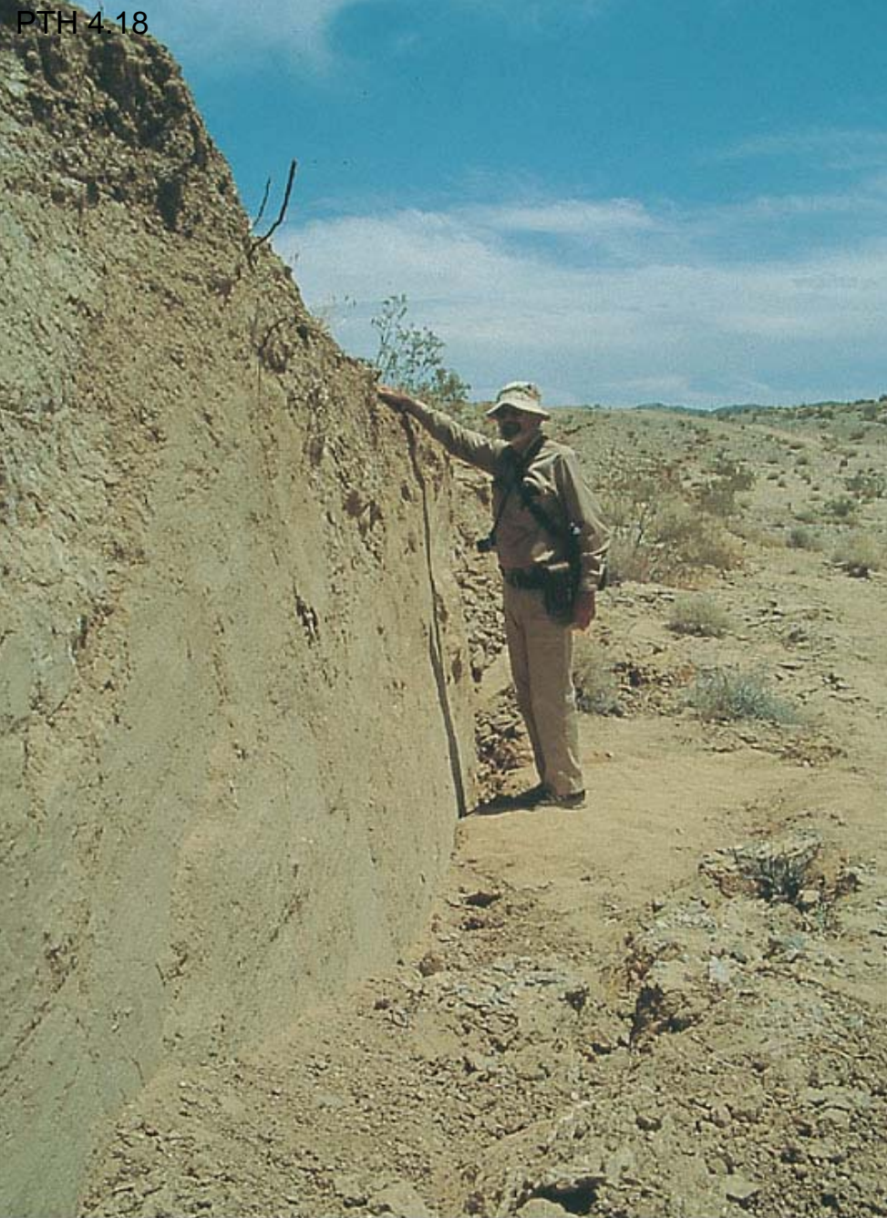
Fault scarp produced by the 1992 Landers, CA earthquake