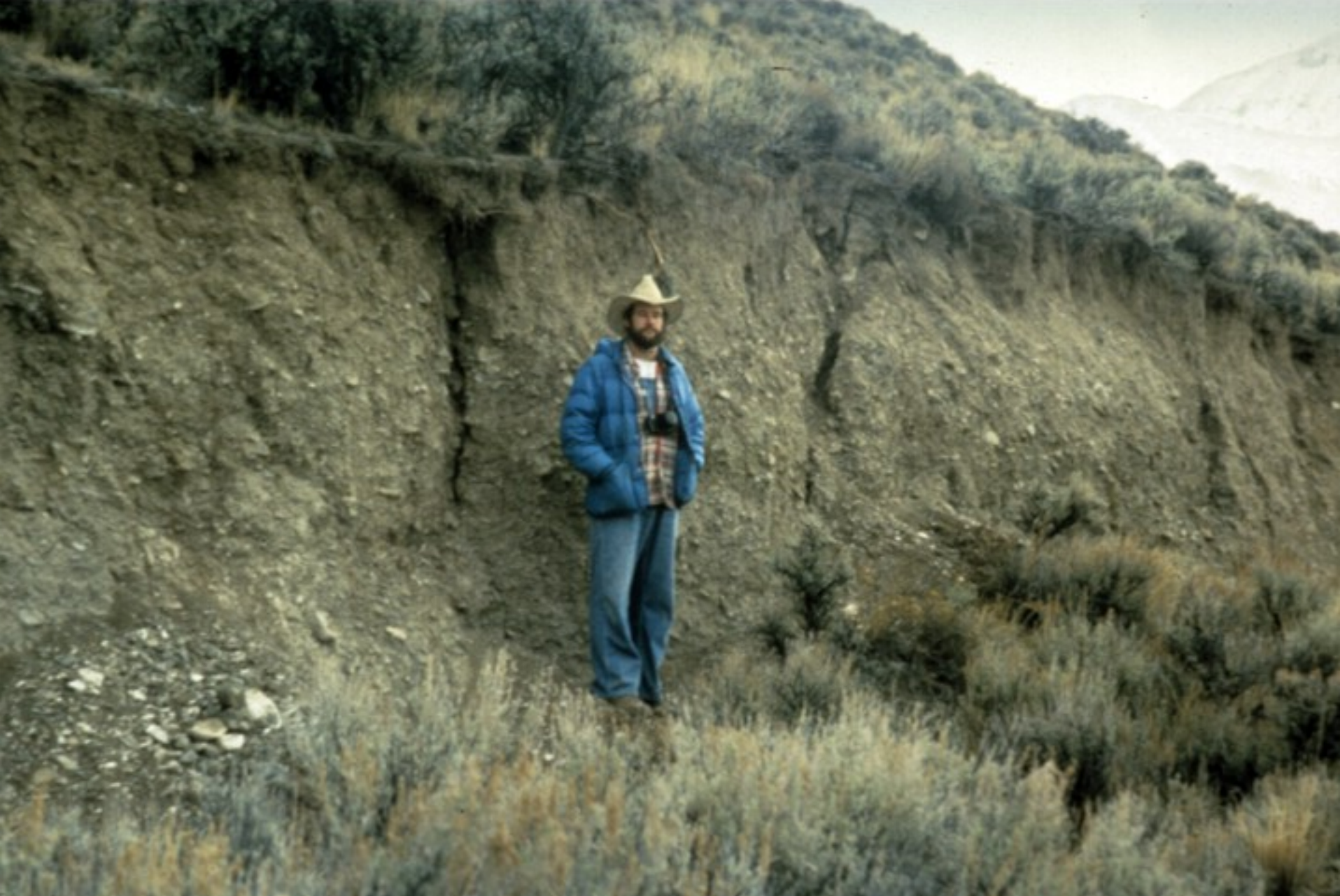
1983 Idaho earthquake (M 7.1) – fault scarp