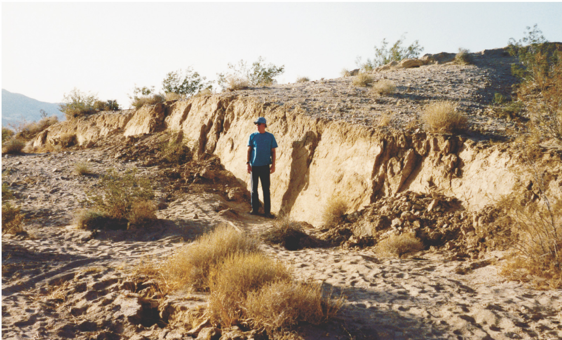
Fault scarp from the 1992 Landers, CA earthquake (M 7.3)