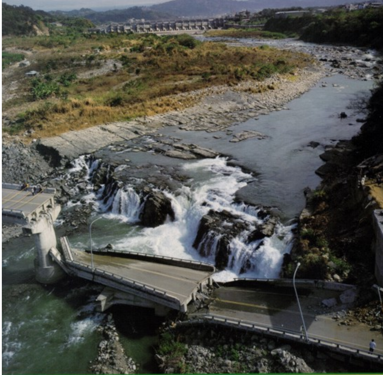
Fault scarp from a recent earthquake in China