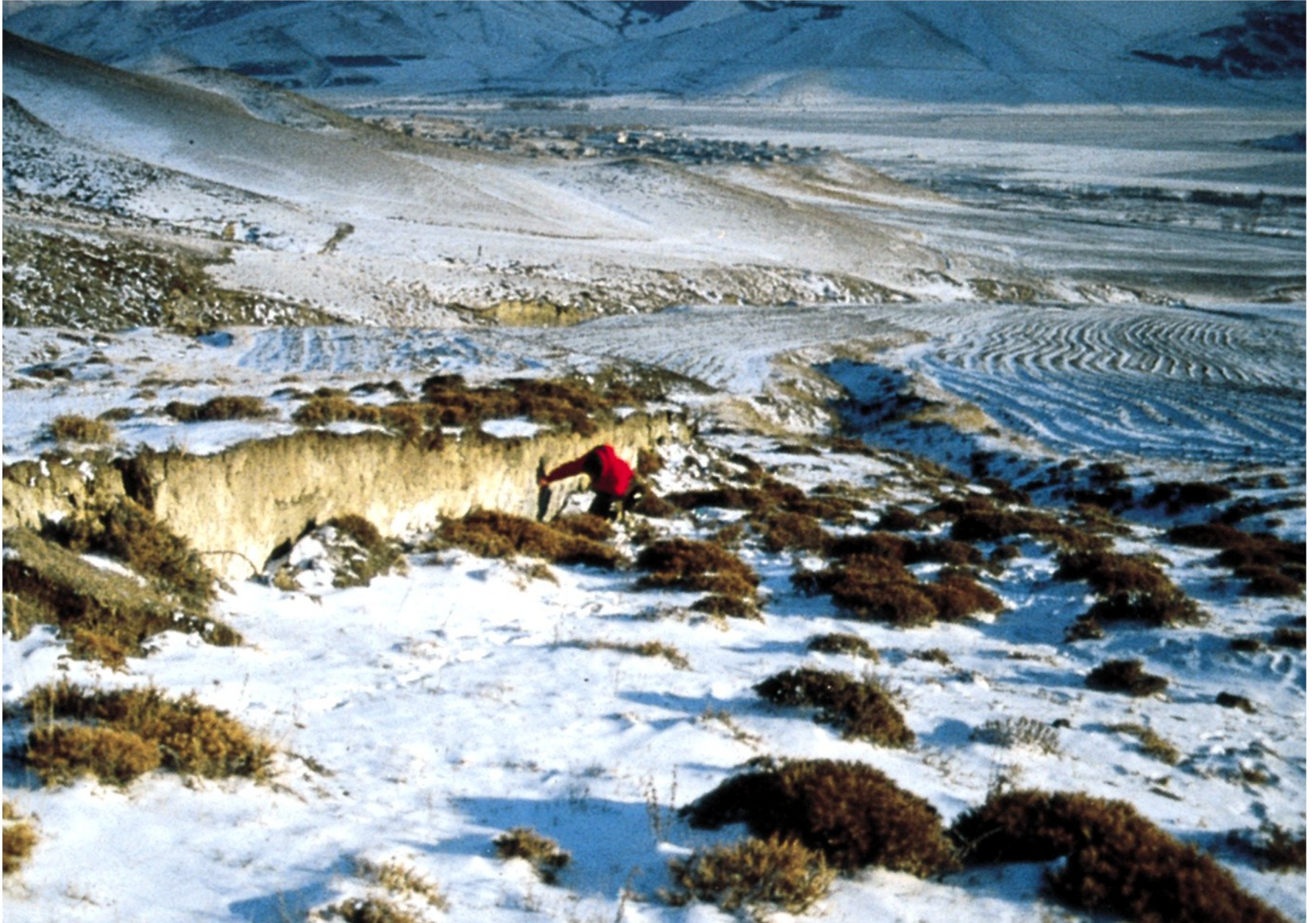
Fault scarp from the 1988 Armenia earthquake