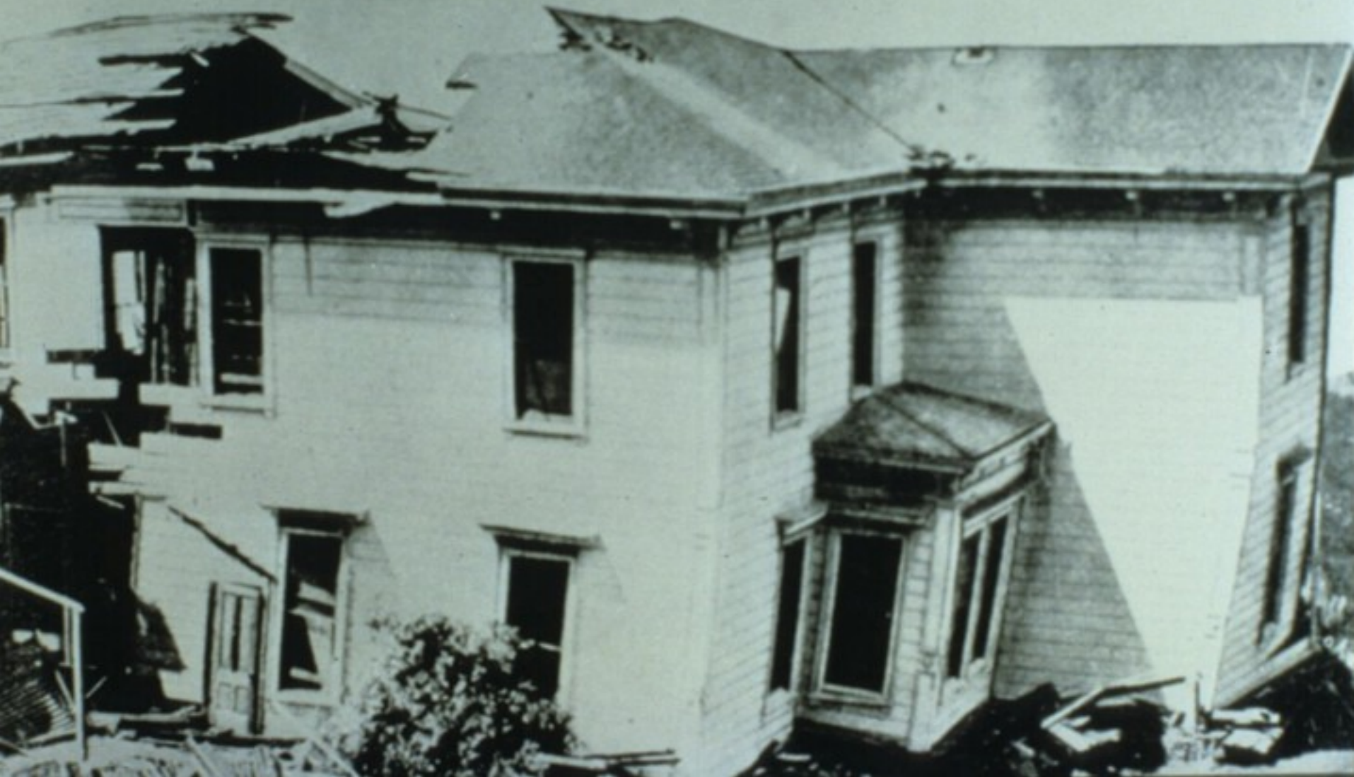
1906 San Francisco, CA earthquake – fault rupture