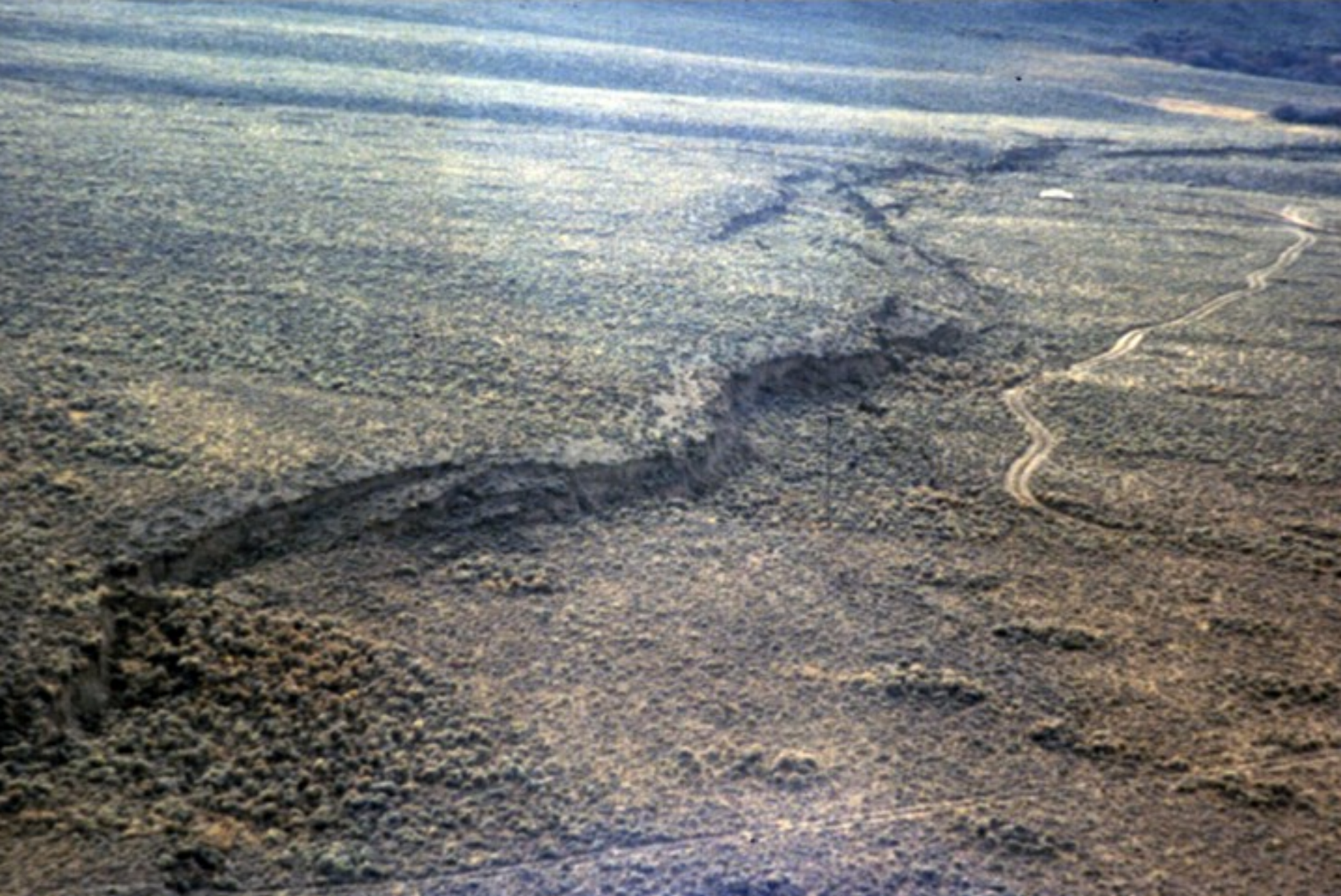
1983 Idaho earthquake (M 7.1) – fault scarp