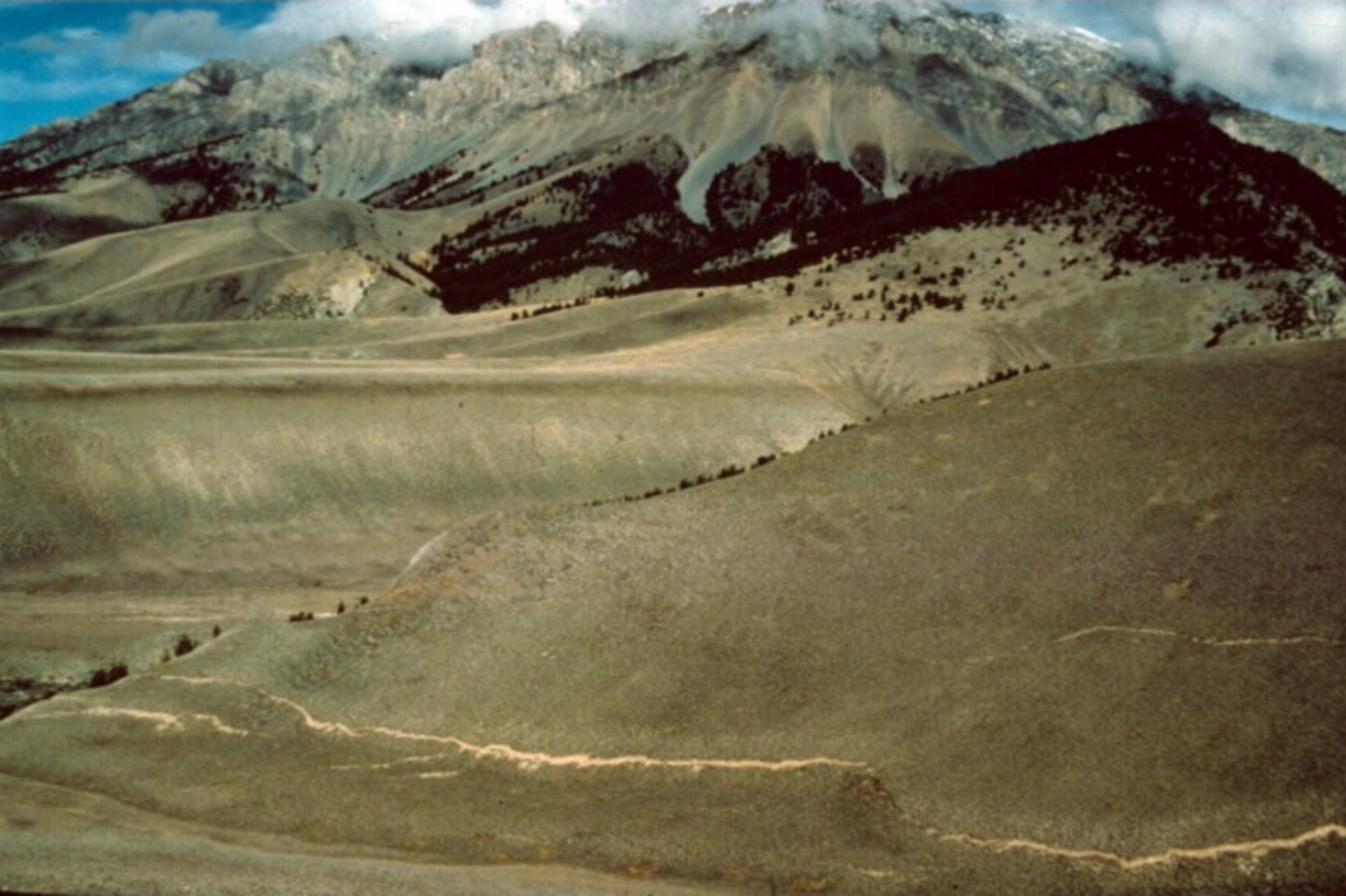
1983 Idaho earthquake (M 7.1) – fault scarp