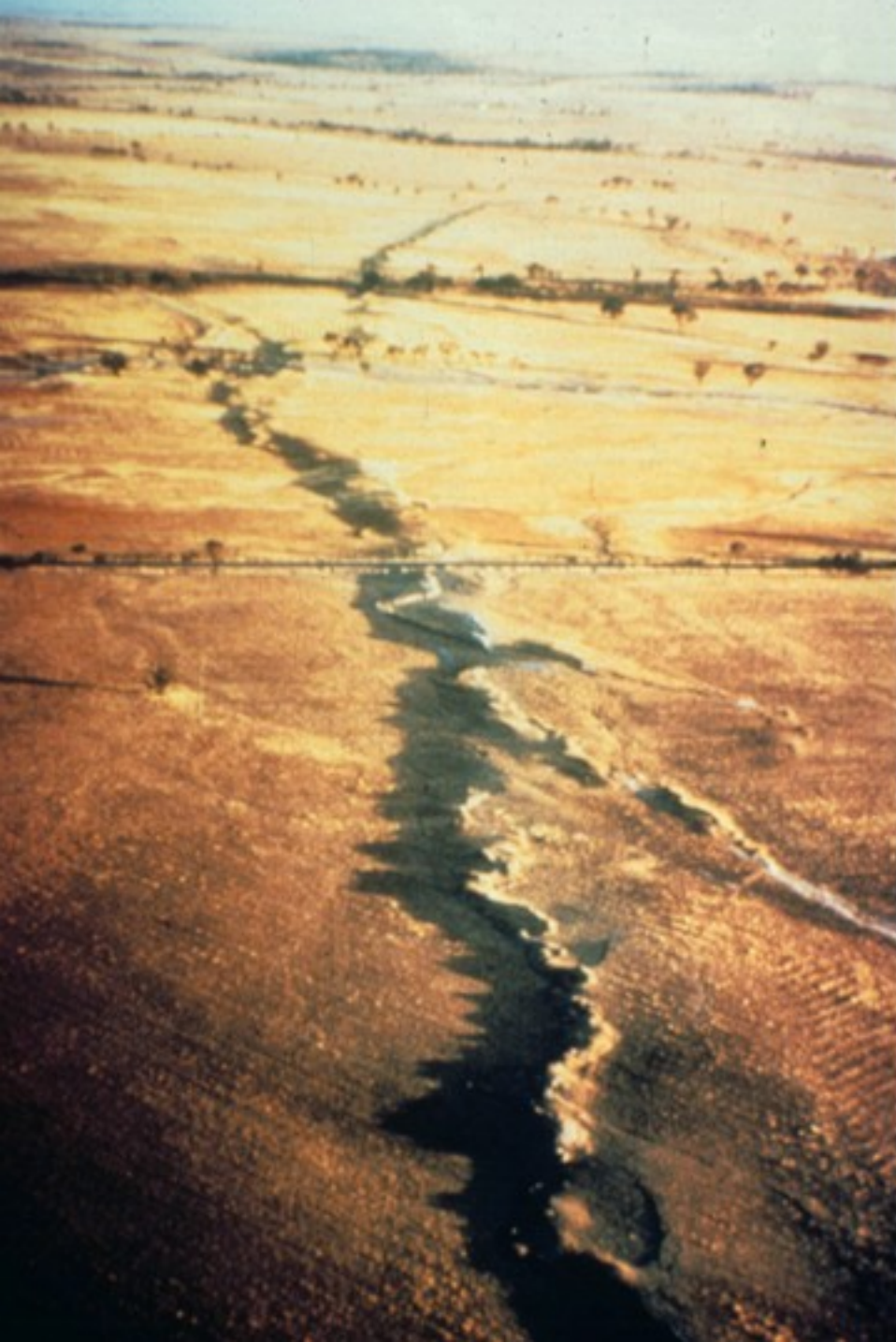
1968 earthquake in Australia – fault scarp