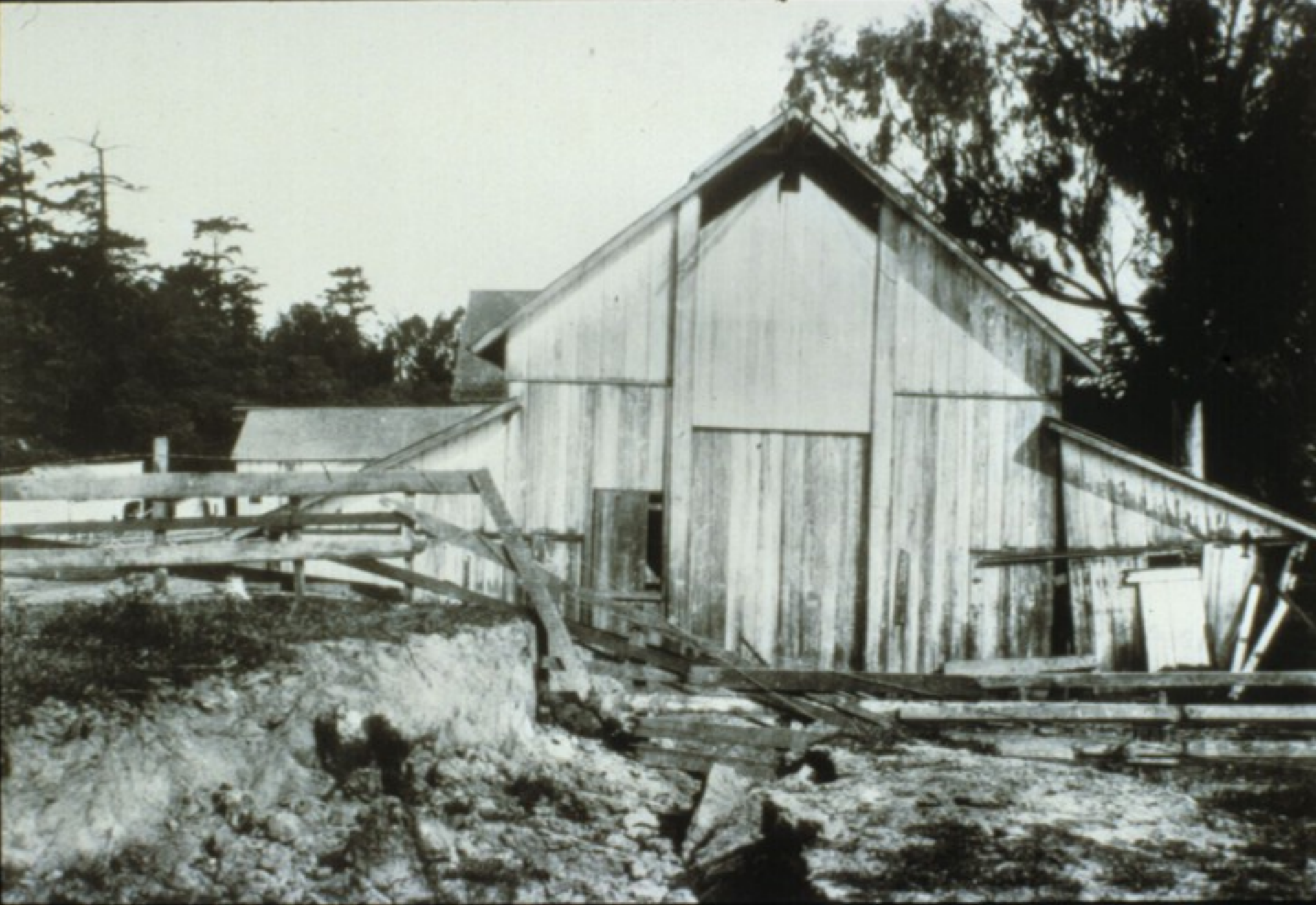
1906 San Francisco, CA earthquake – fault scarp