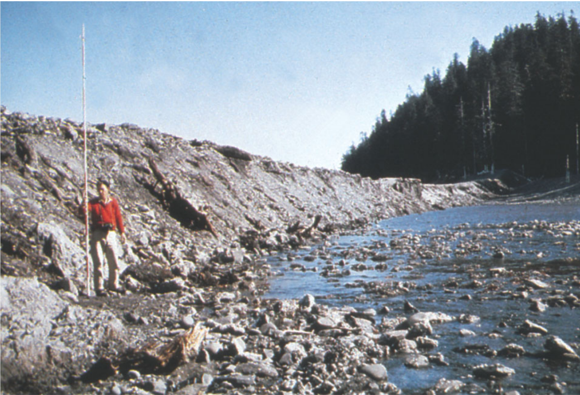
~5 m fault scarp from the 1964 Alaska earthquake