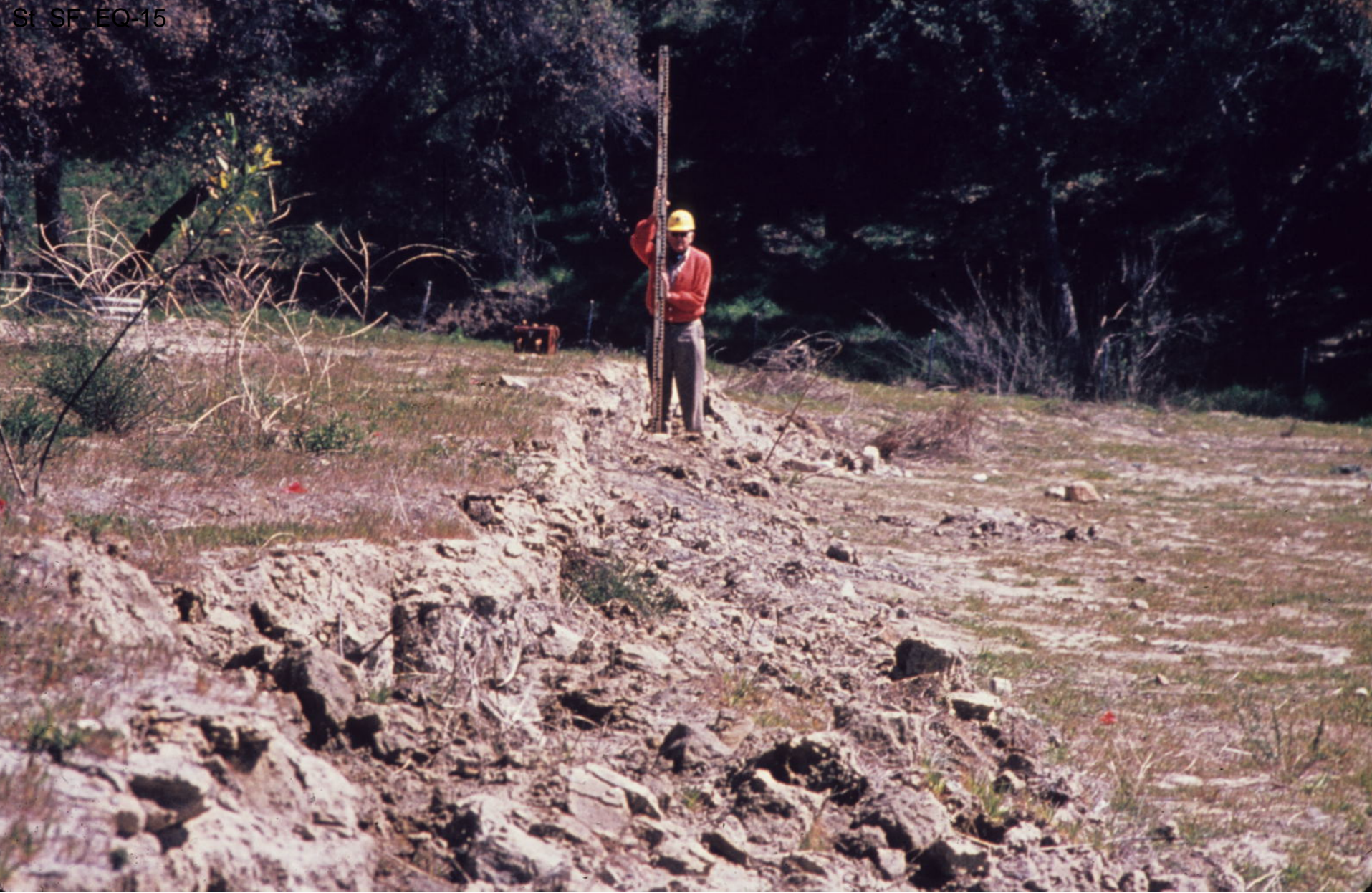
1971 San Fernando Valley, CA earthquake (M 6.6) – fault scarp