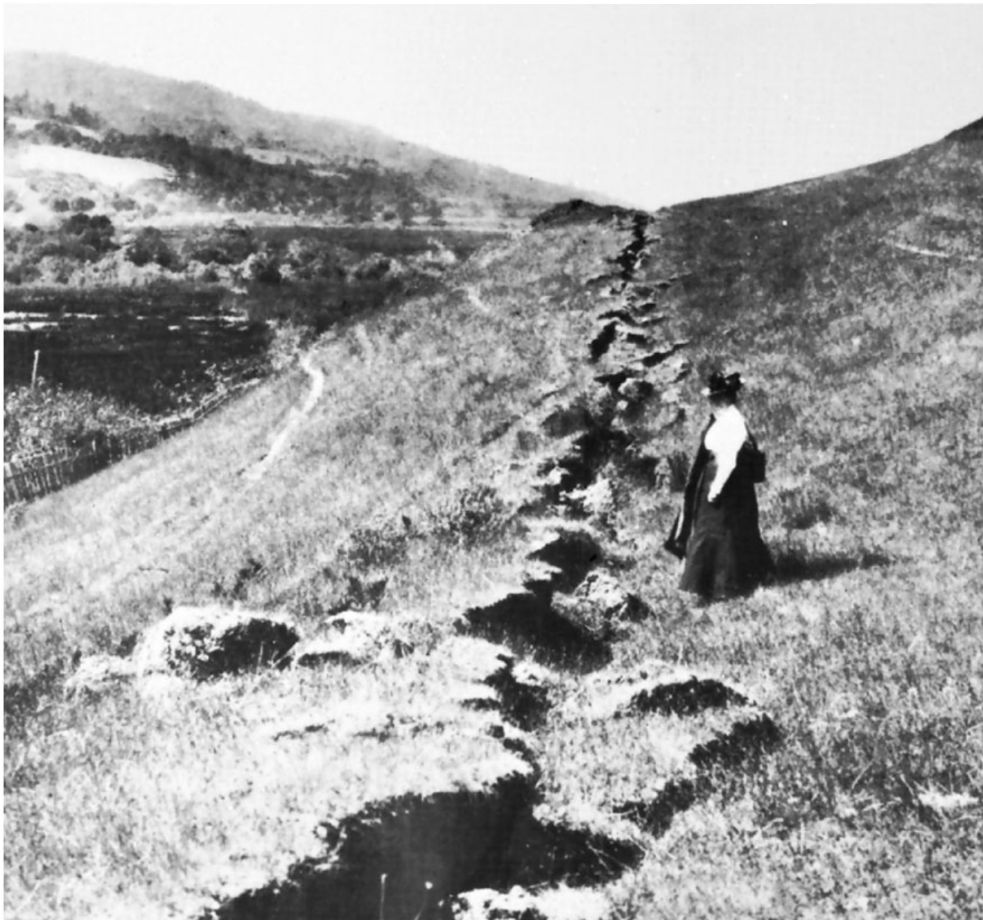
Fault scarp from the 1906 San Francisco, CA earthquake