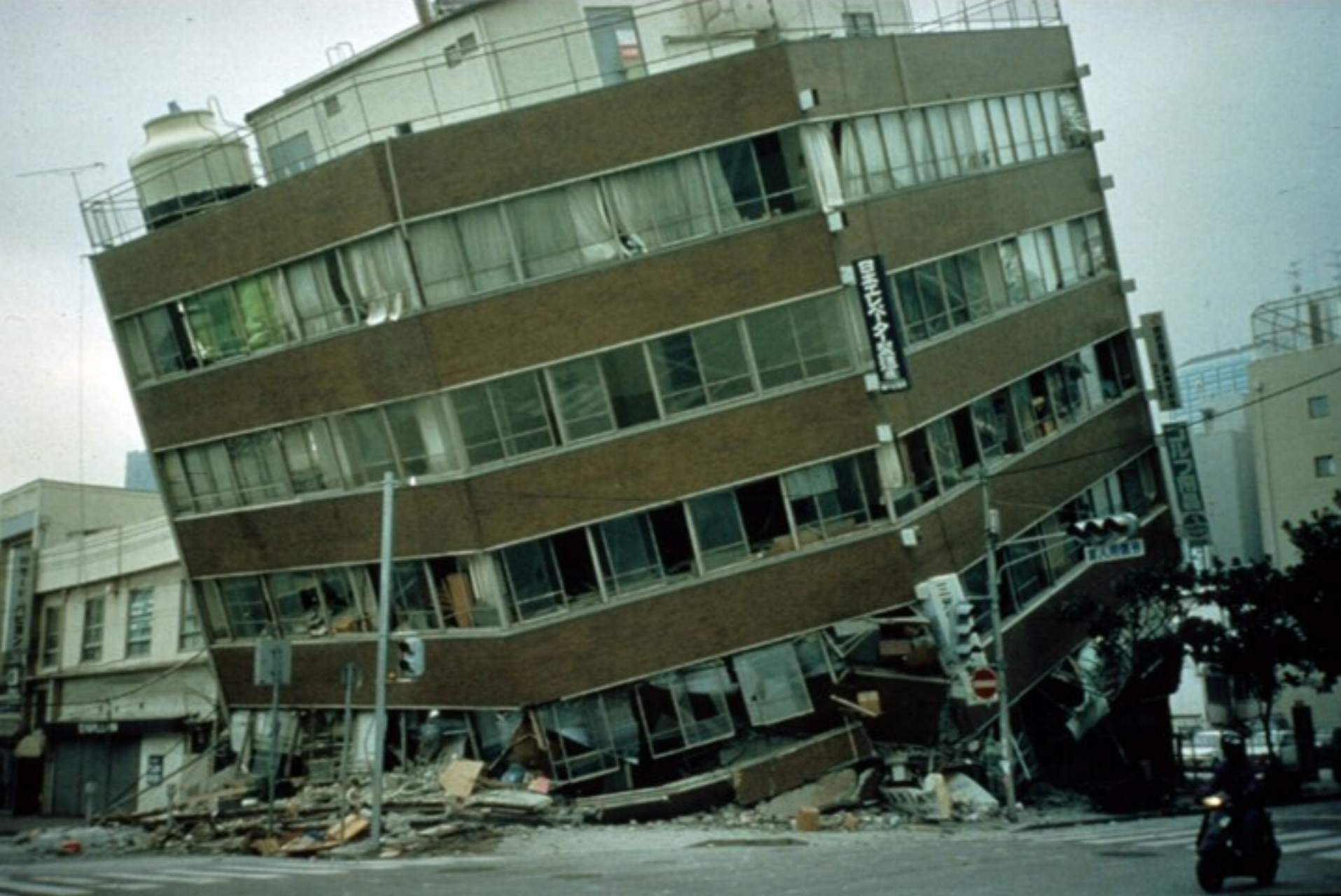
1995 Kobe, Japan earthquake (M 6.9) – damage from ground shaking