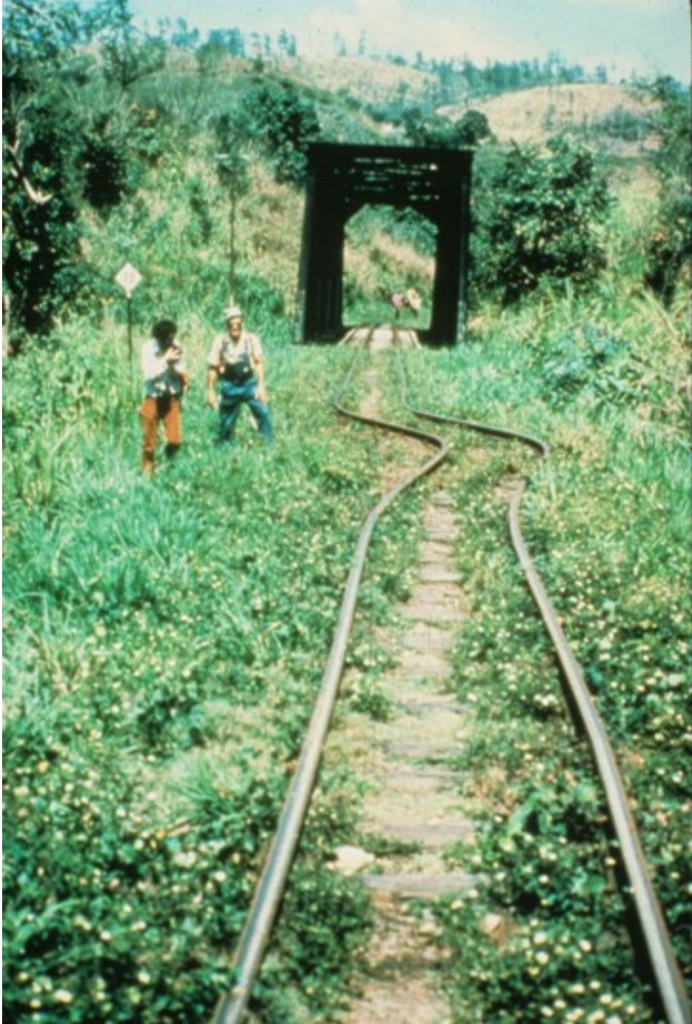
Tracks deformed by Love surface waves during a 1977 earthquake in Guatemala