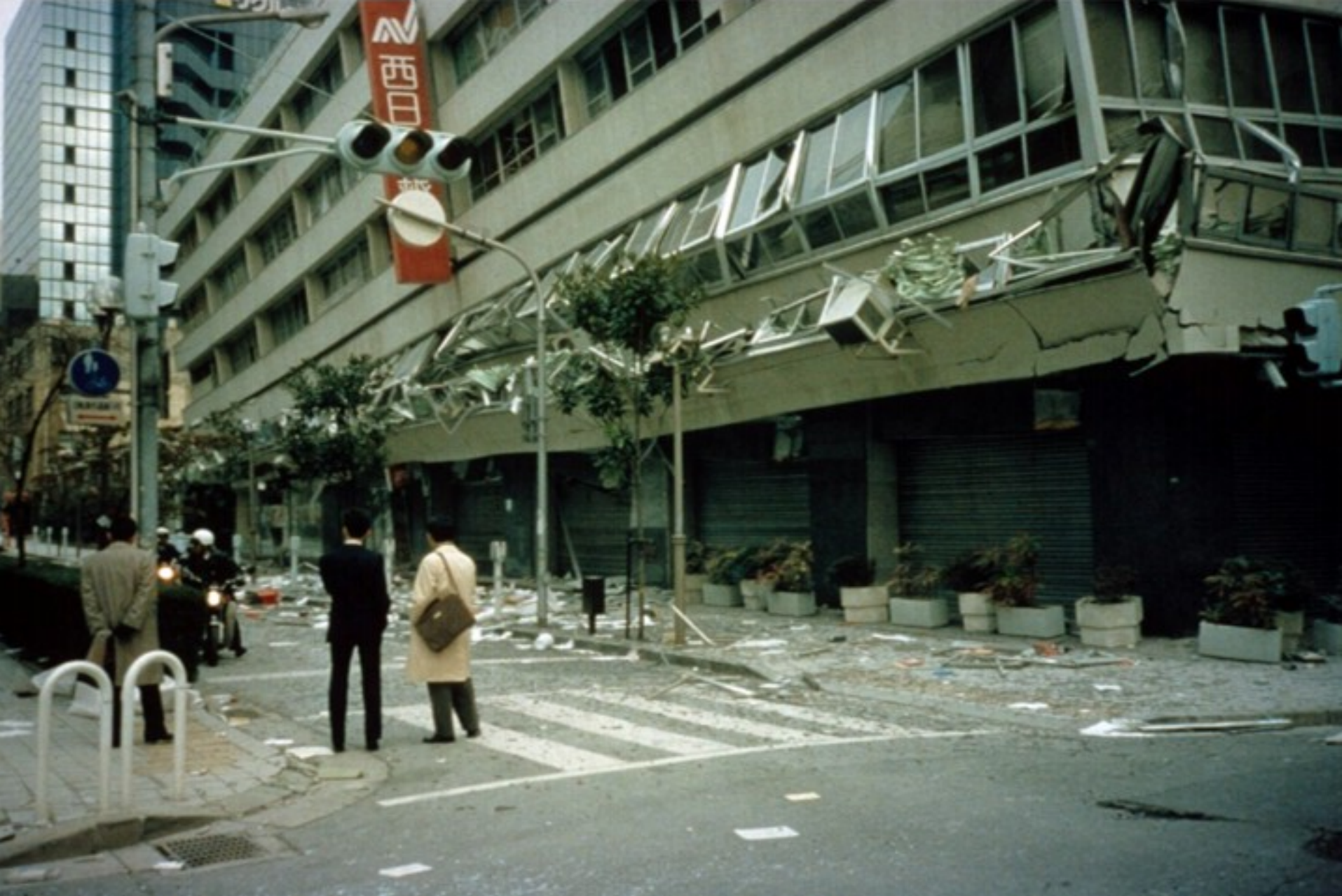
1995 Kobe, Japan earthquake (M 6.9) – damage from ground shaking