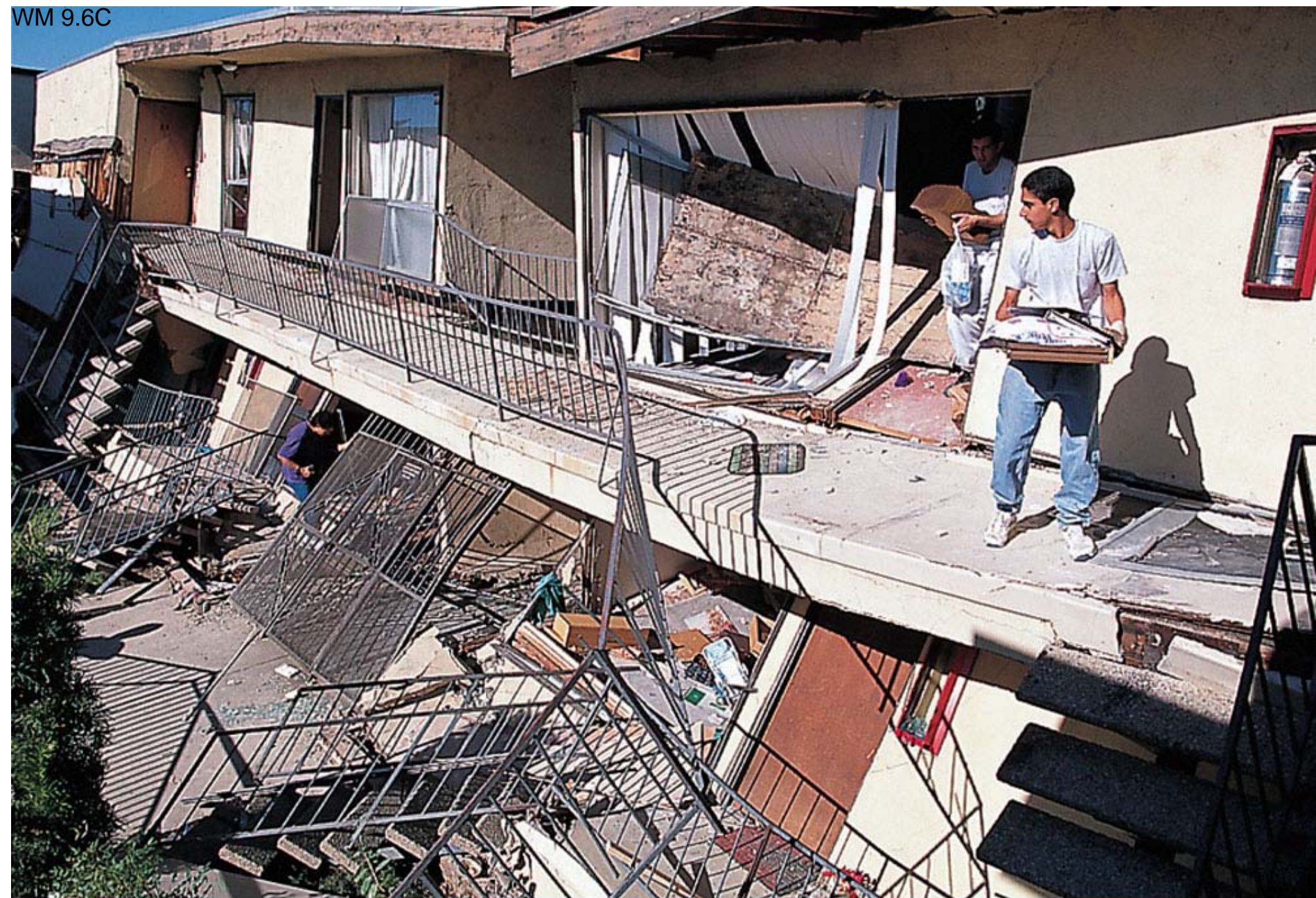
Damage from the 1994 Northridge earthquake, CA (M 6.7)