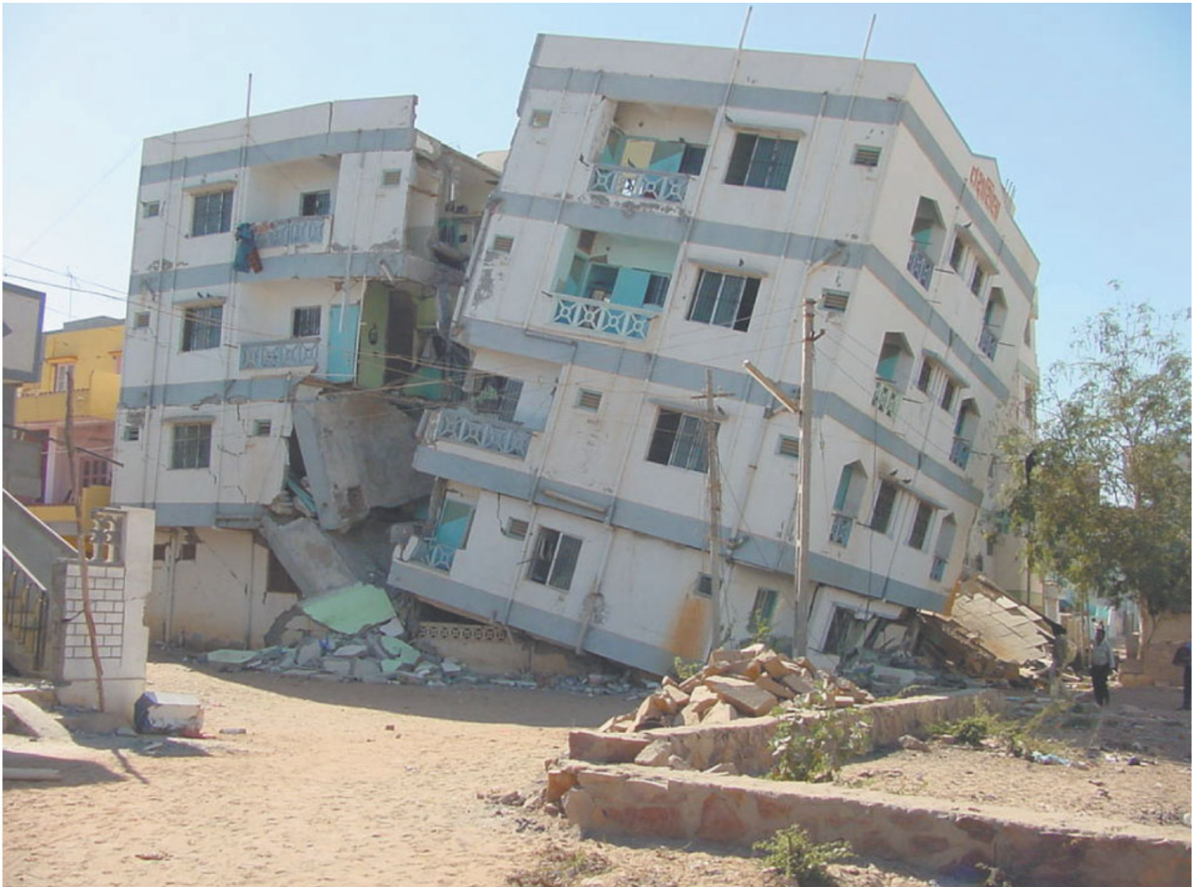
Collapsed building from 2001 Gujarat, India earthquake (M 7.7)