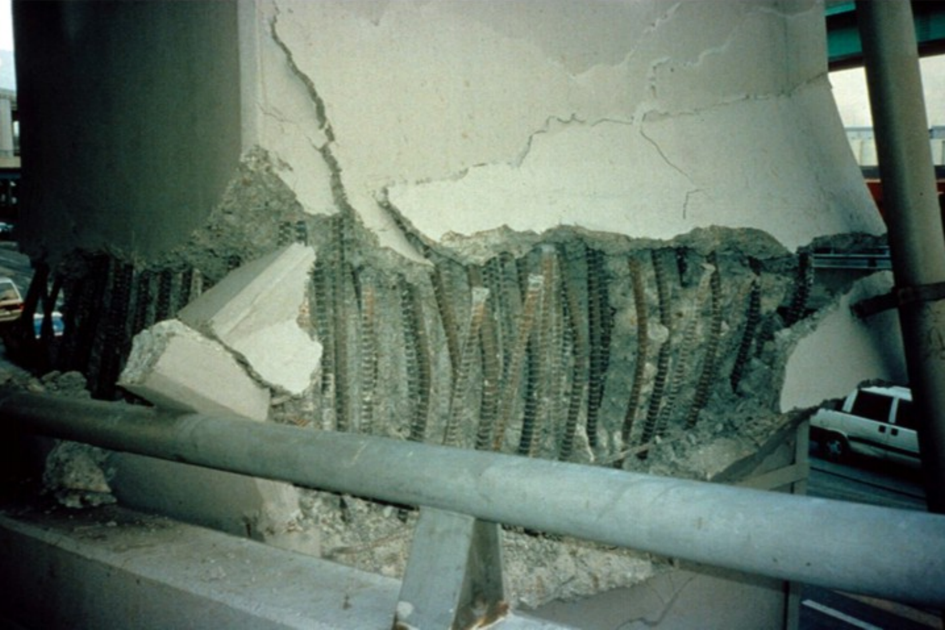
1995 Kobe, Japan earthquake (M 6.9) – damage from ground shaking