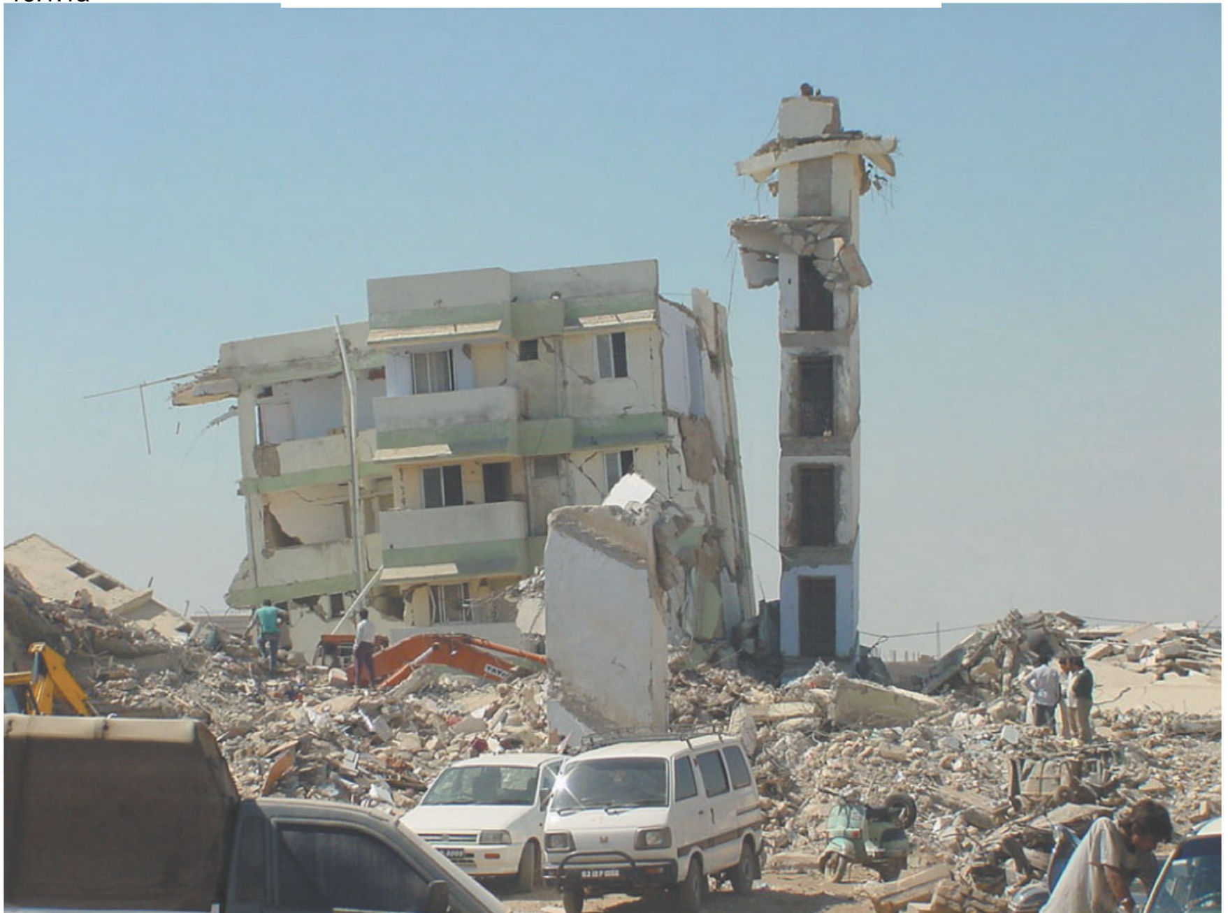
Collapsed building from 2001 Gujarat, India earthquake (M 7.7)