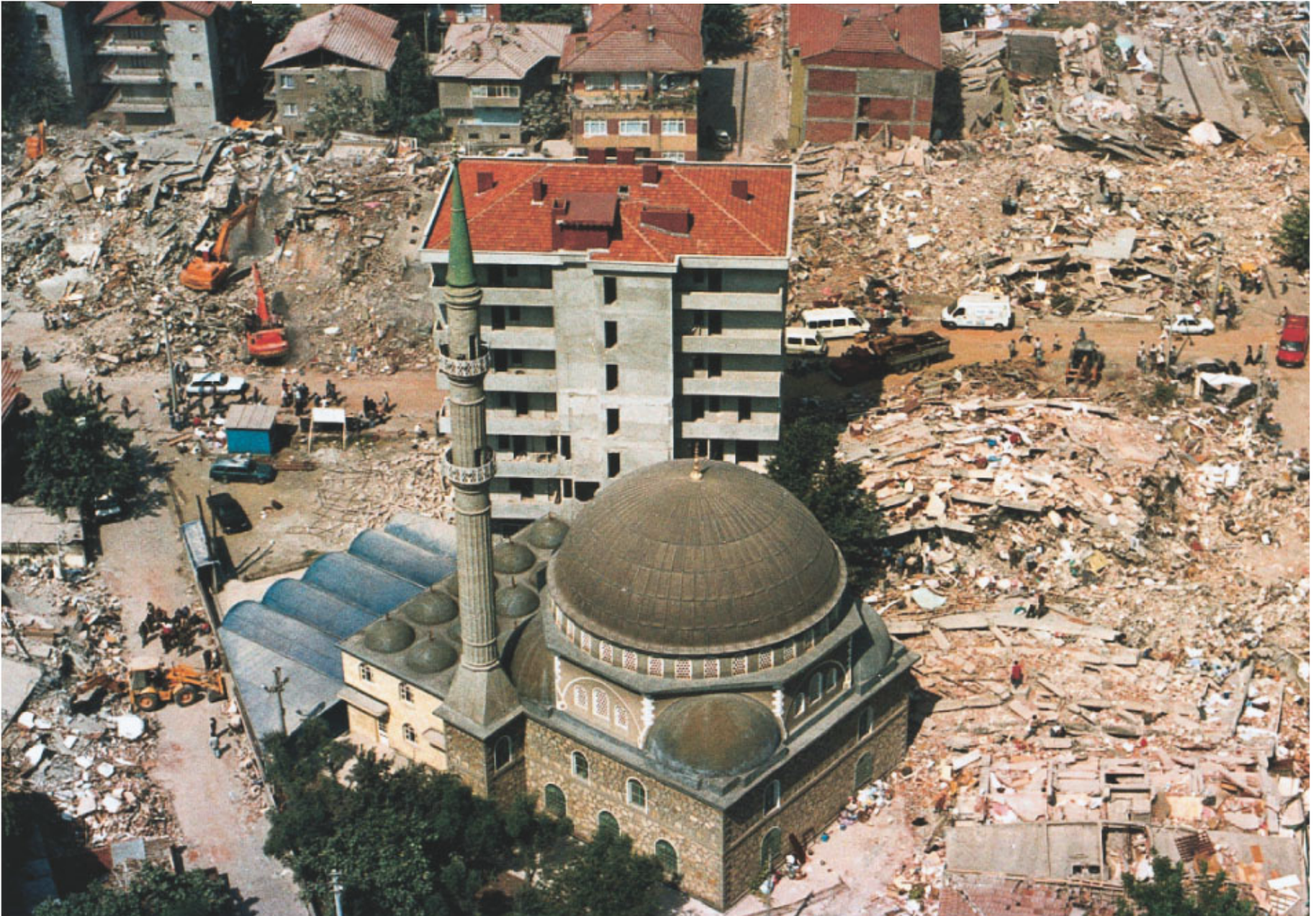
Collapsed buildings from the 1999 Izmit, Turkey earthquake