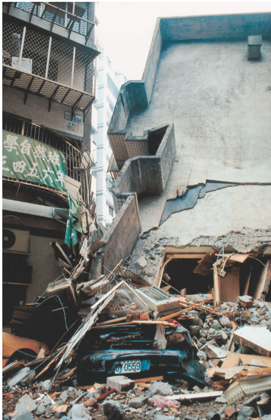
Collapsed building from the 1999 Taiwan earthquake (M 7.6)