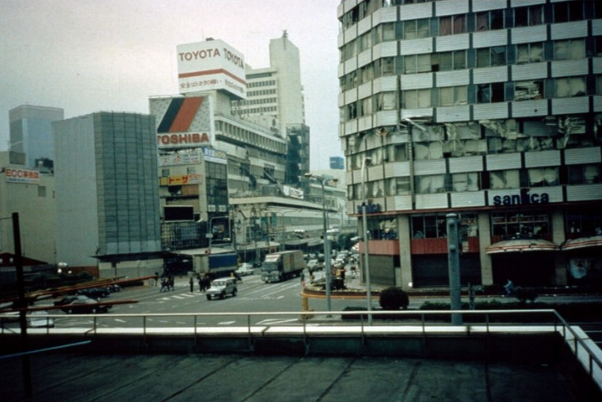
1995 Kobe, Japan earthquake (M 6.9) – damage from ground shaking