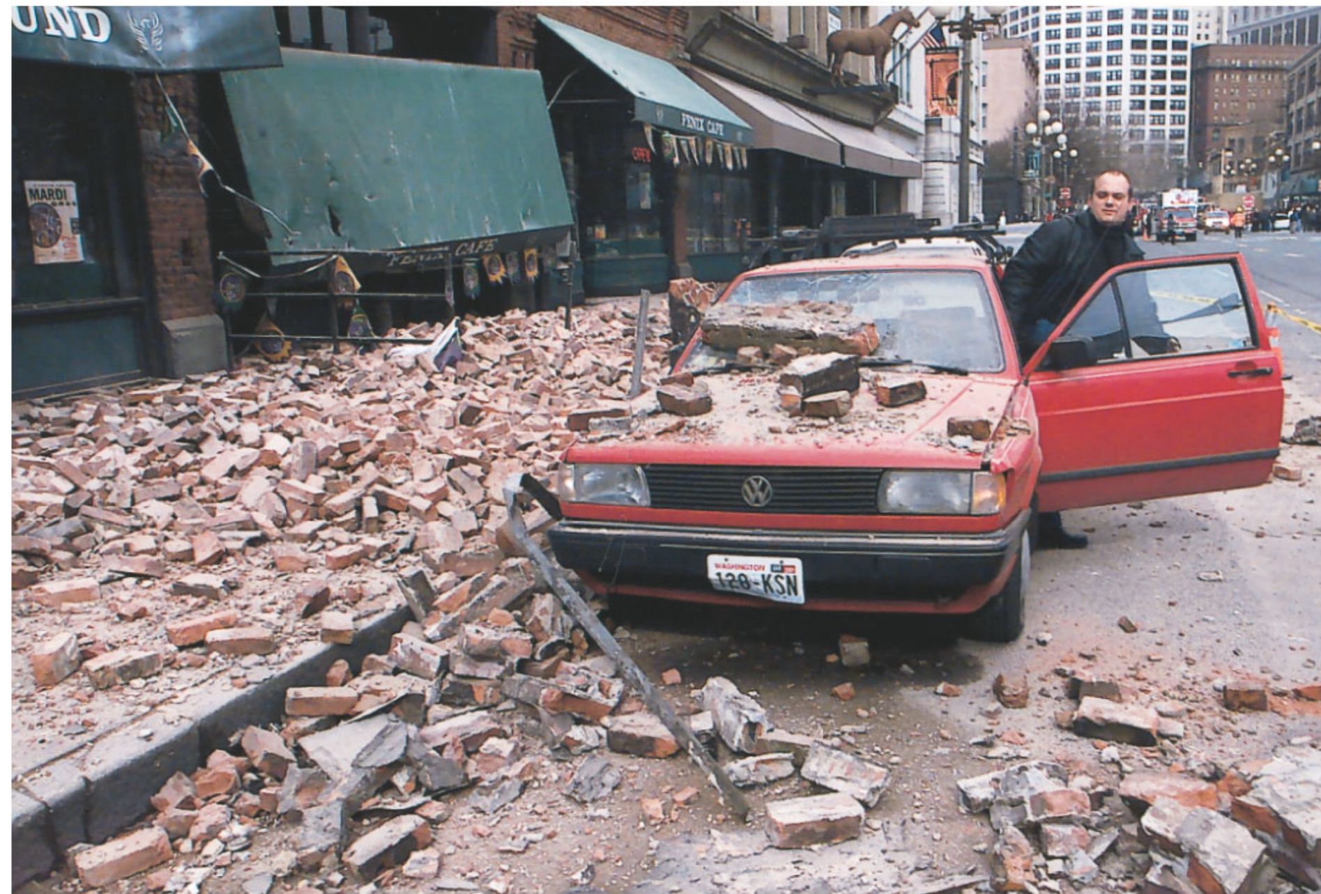
Damage in Seattle, WA from a 2001 earthquake