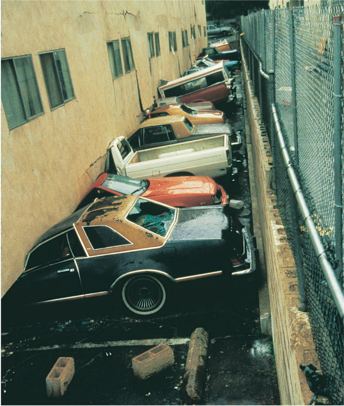
Damage from the 1994 Northridge earthquake, CA (M 6.7)