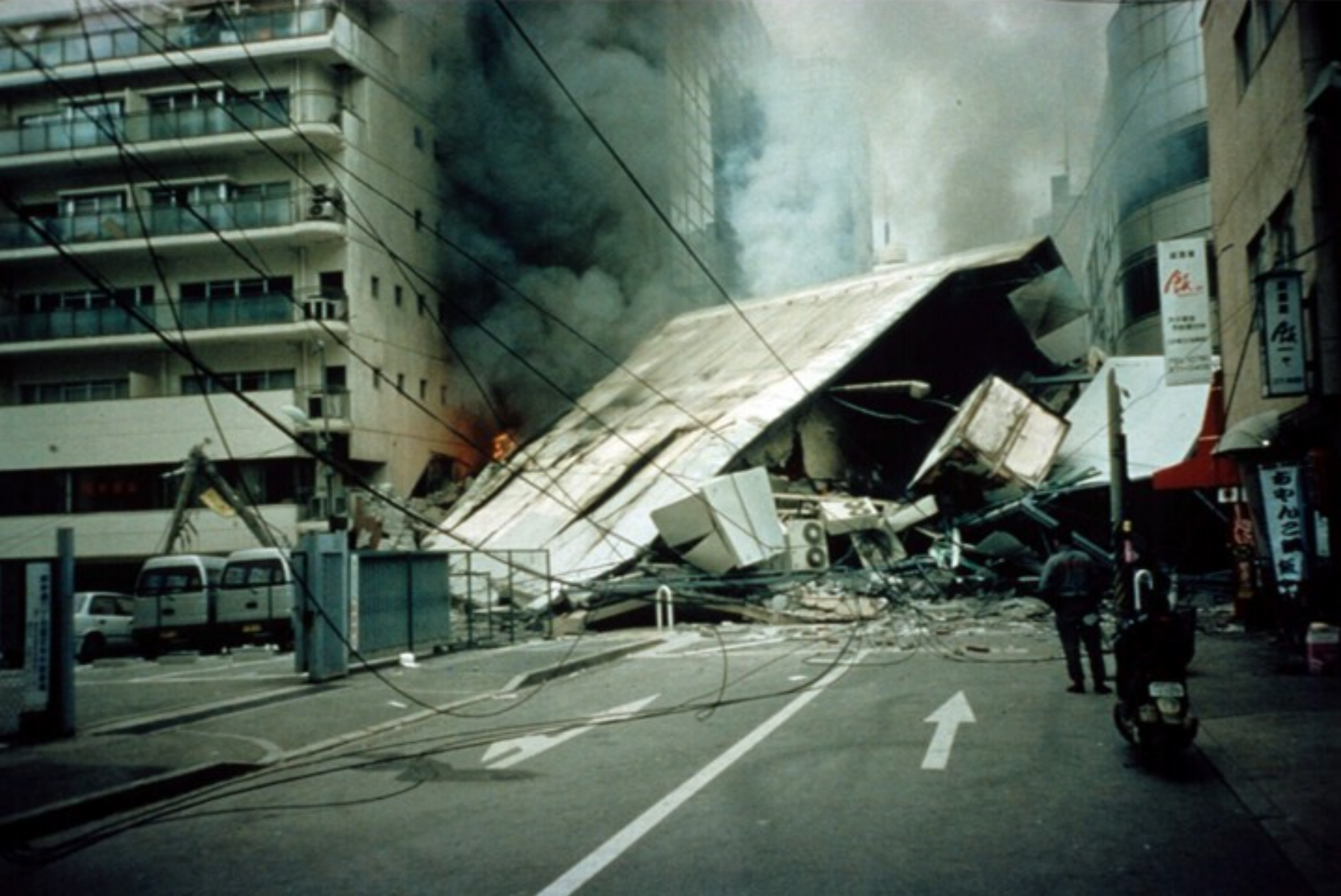
1995 Kobe, Japan earthquake (M 6.9) – damage from ground shaking