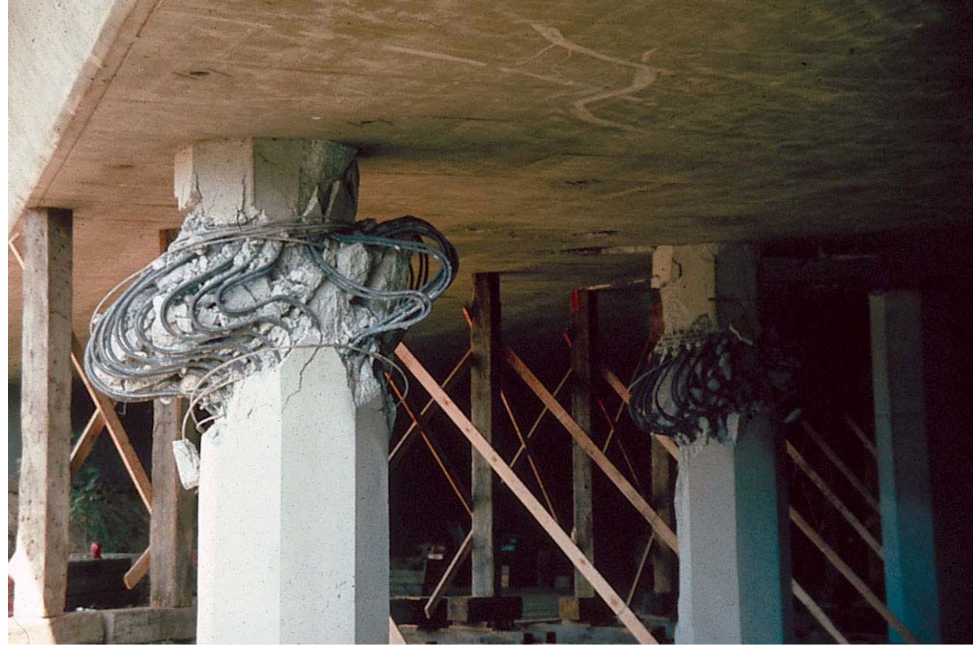
Damage to freeway columns from the 1994 Northridge, CA earthquake (M 6.7)