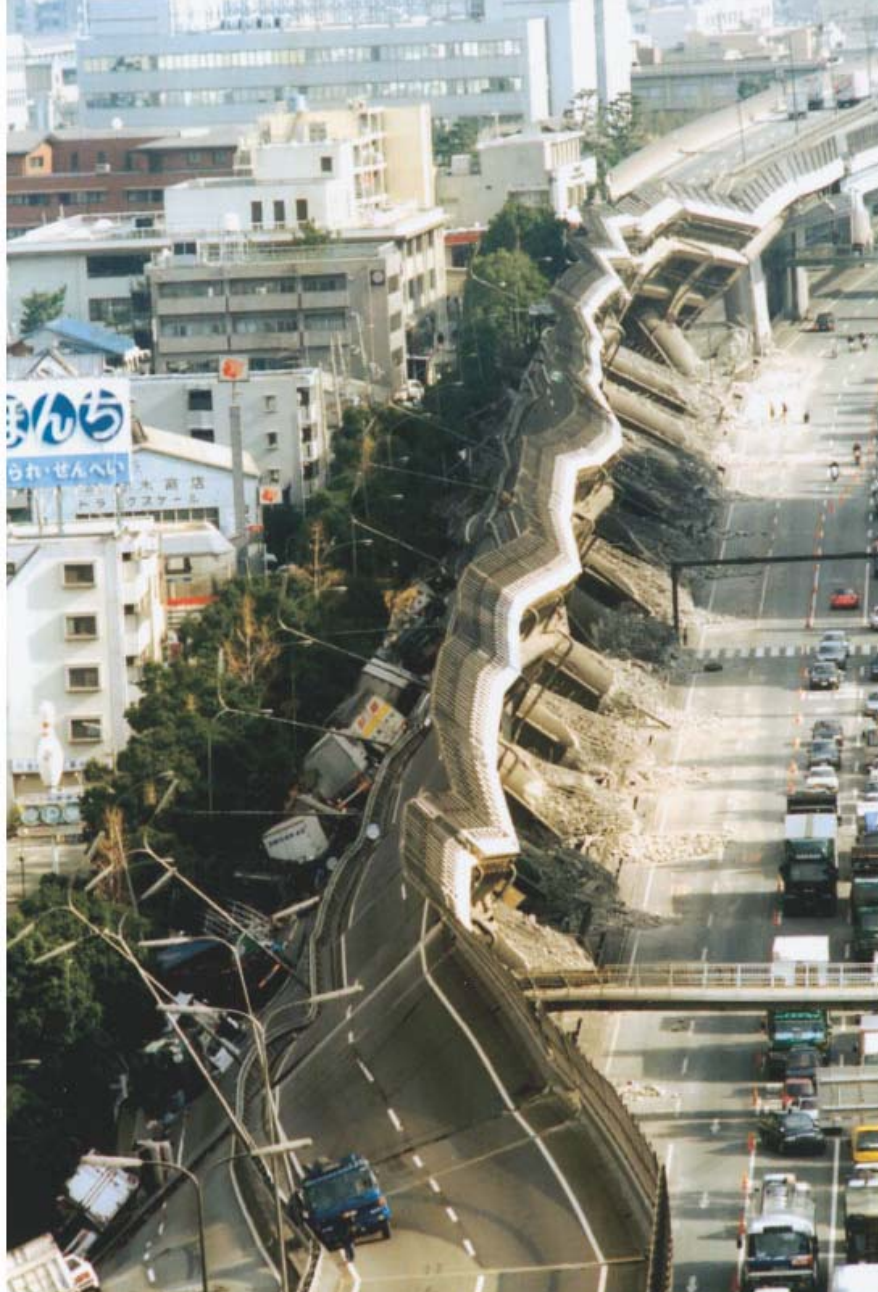
1995 Kobe, Japan earthquake (M 6.9) – damage from ground shaking