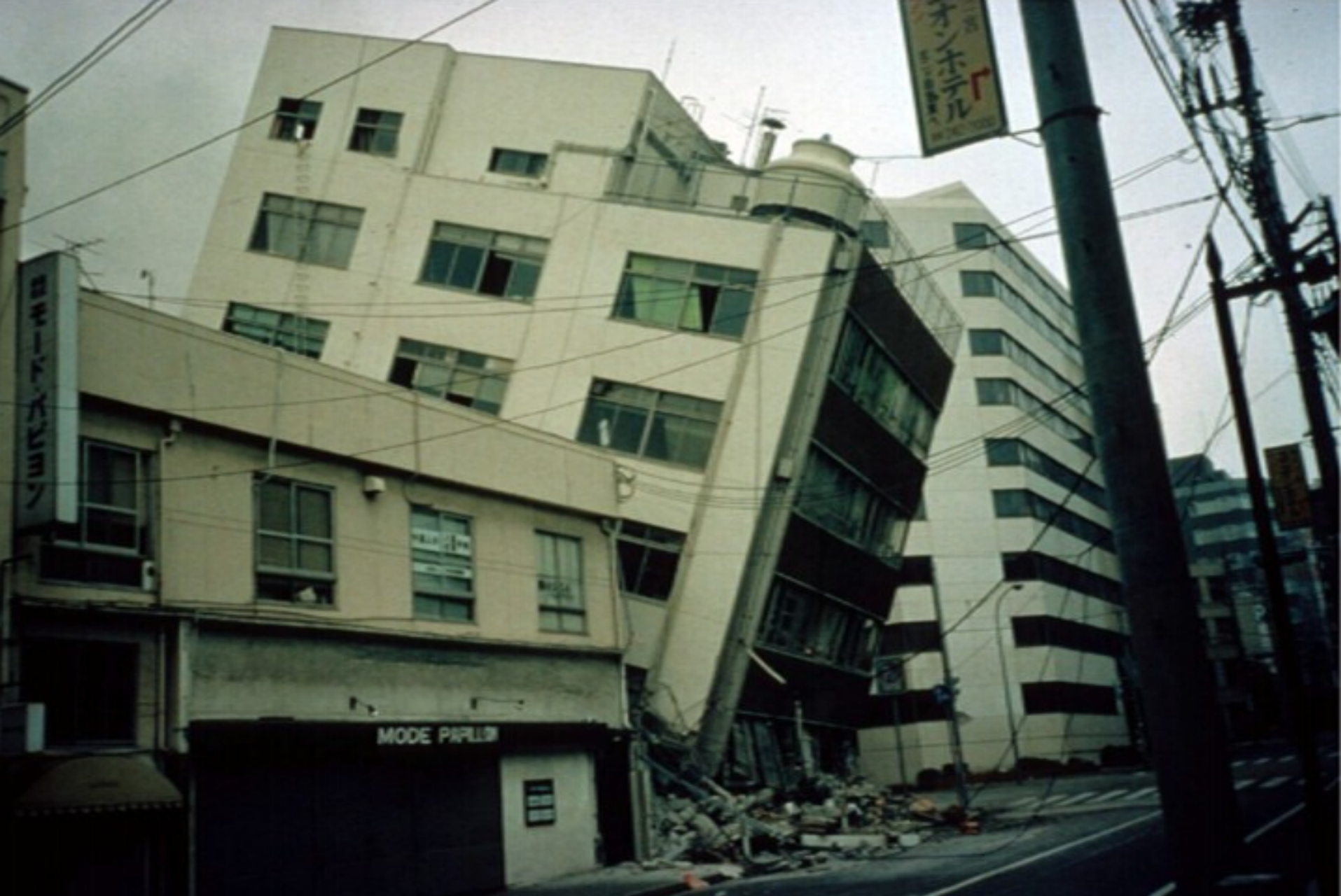
1995 Kobe, Japan earthquake (M 6.9) – damage from ground shaking